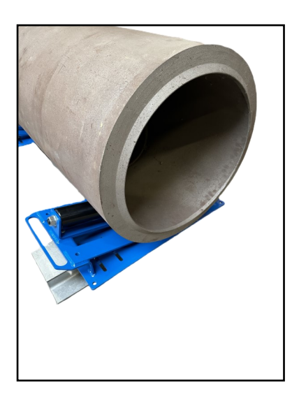
Single roller version for LENGTH rolling of the 24" pipe.