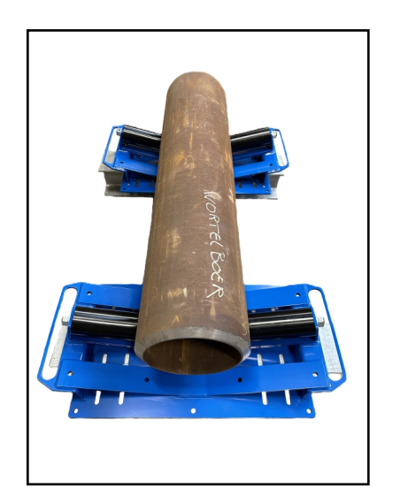
Single roller version for LENGTH rolling of the 10" pipe.

The roller block can be equipped with steel - blackened - rollers OR with steel rollers with a POLYURETHANE type P700 D coating of approx. 8.5 mm. thickness.